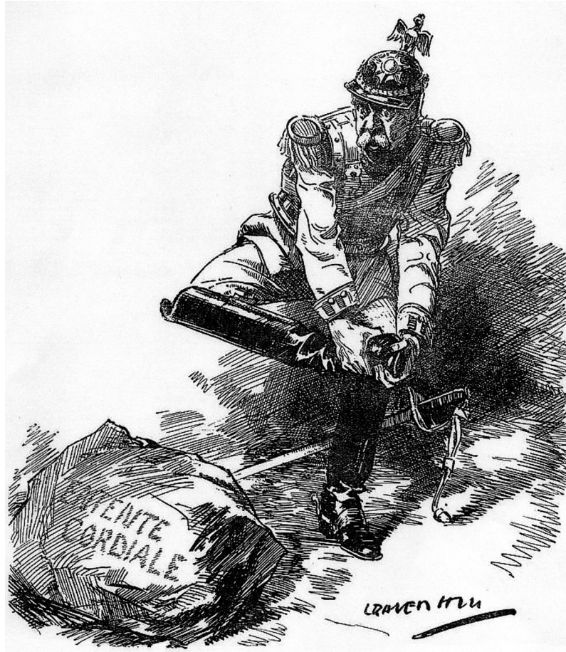
A British cartoon, entitled 'Solid', published in August 1911. The Kaiser is saying 'Donnerwetter! It's rock. I thought it was going to be paper.'