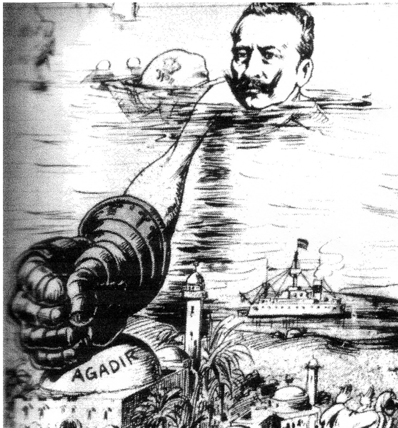
A cartoon published in Germany during the crisis. The figure is William II.